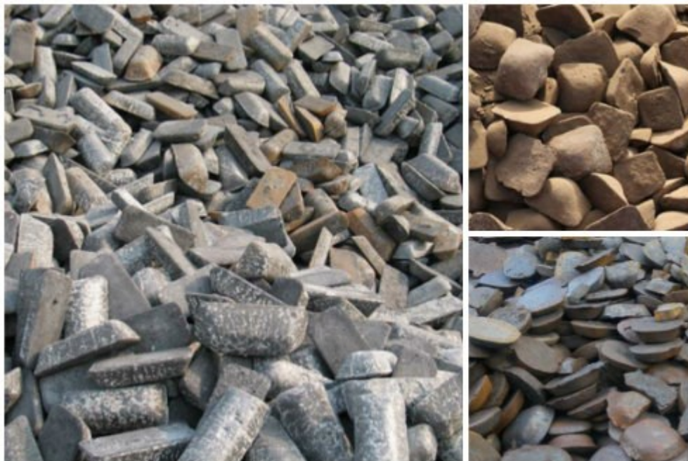
Fig. 1 Pig iron ingots