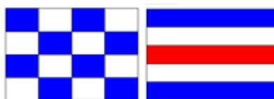
Fig. 2 N flag flown over C flag to indicate distress